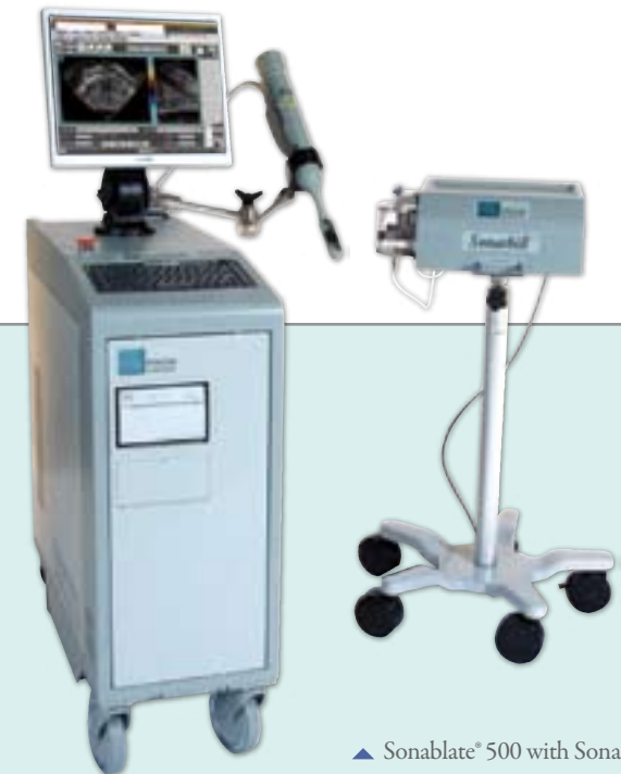
▲ Sonablate® 500 with Sonachill™

The Sonablate® is the only truly non-invasive prostate cancer treatment that does not require a transurethral resection of the prostate (TURP), an invasive, surgical procedure, prior to treatment in order to achieve effective results.